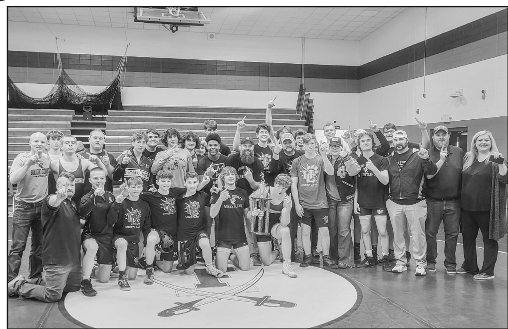
Union County wrestling after securing the program's first Area title on Saturday. when victories by freshmen delivered.

off 24-straight points, putting the Panthers in a 30-18 hole